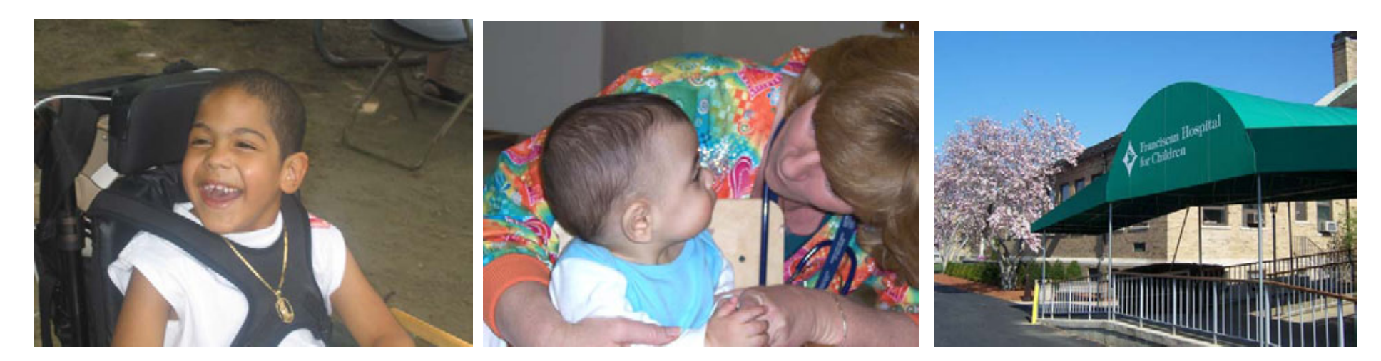
Take a look inside