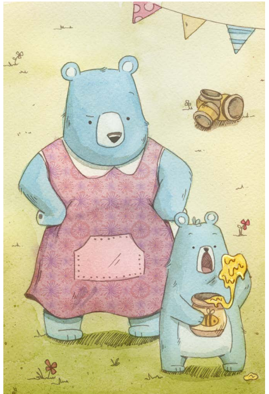
This hand is not clean.