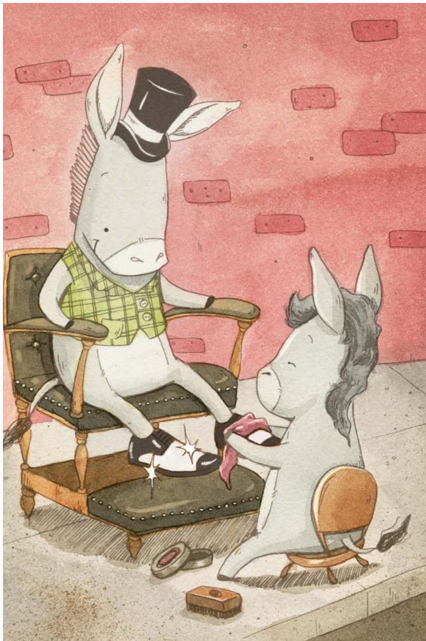
This shoe is clean.