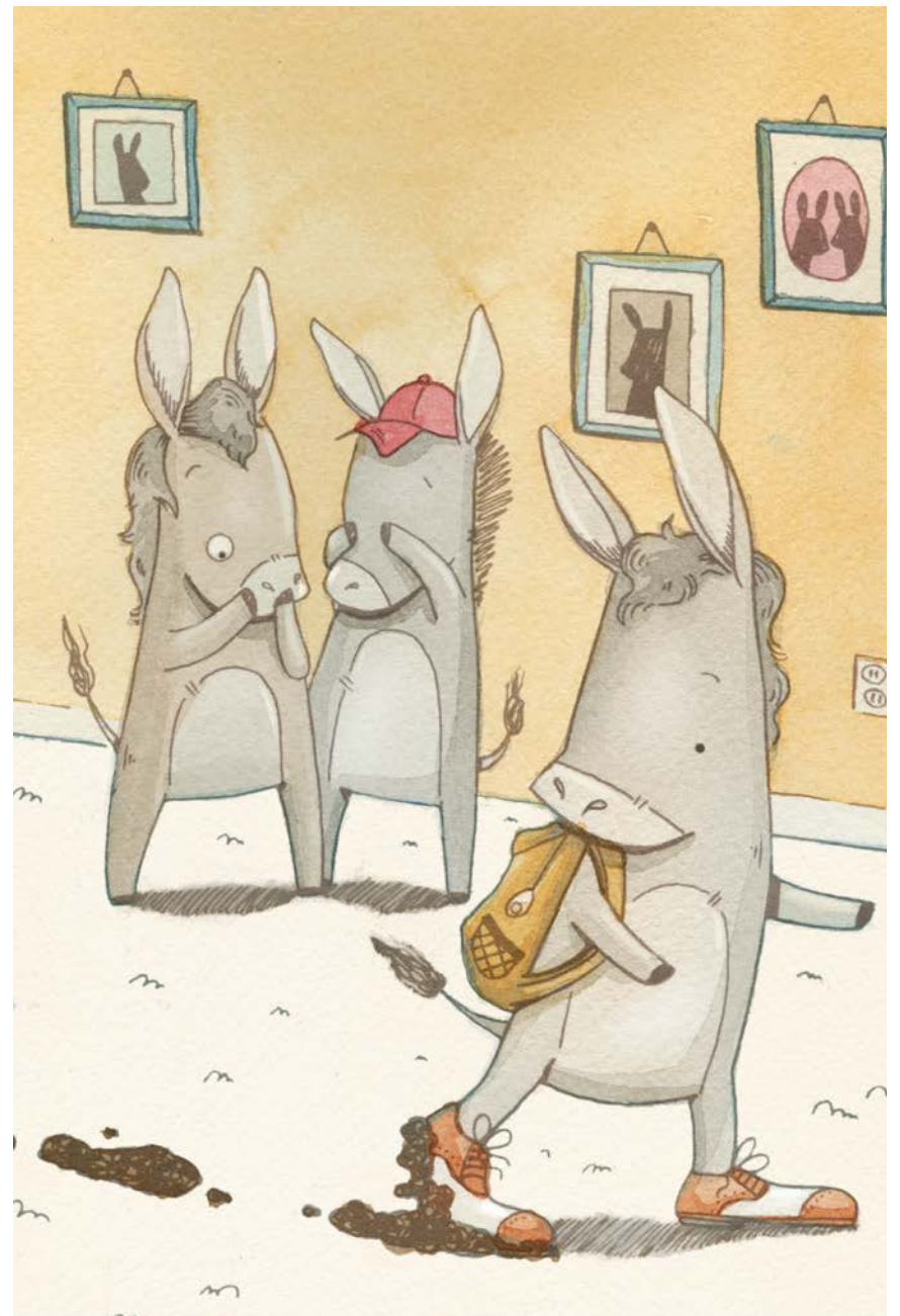
This shoe is not clean.