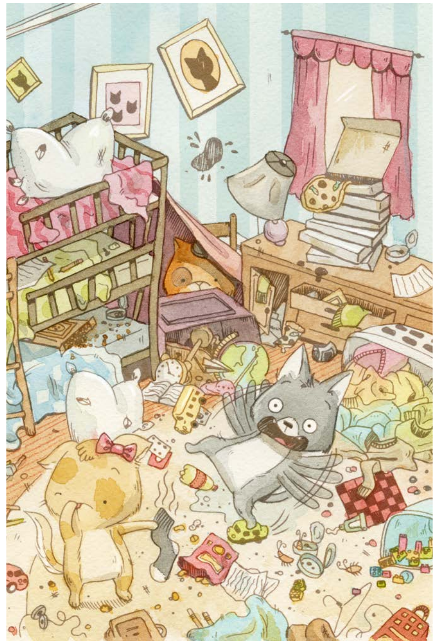
This room is not clean.