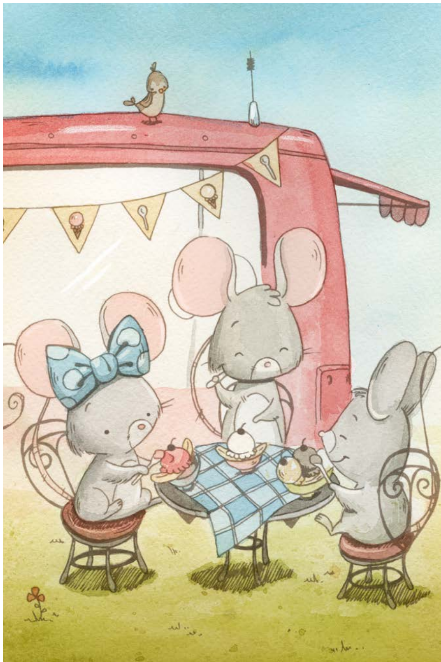
This food is clean.