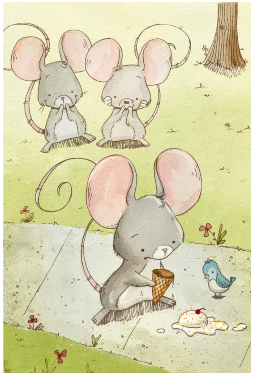
This food is not clean.