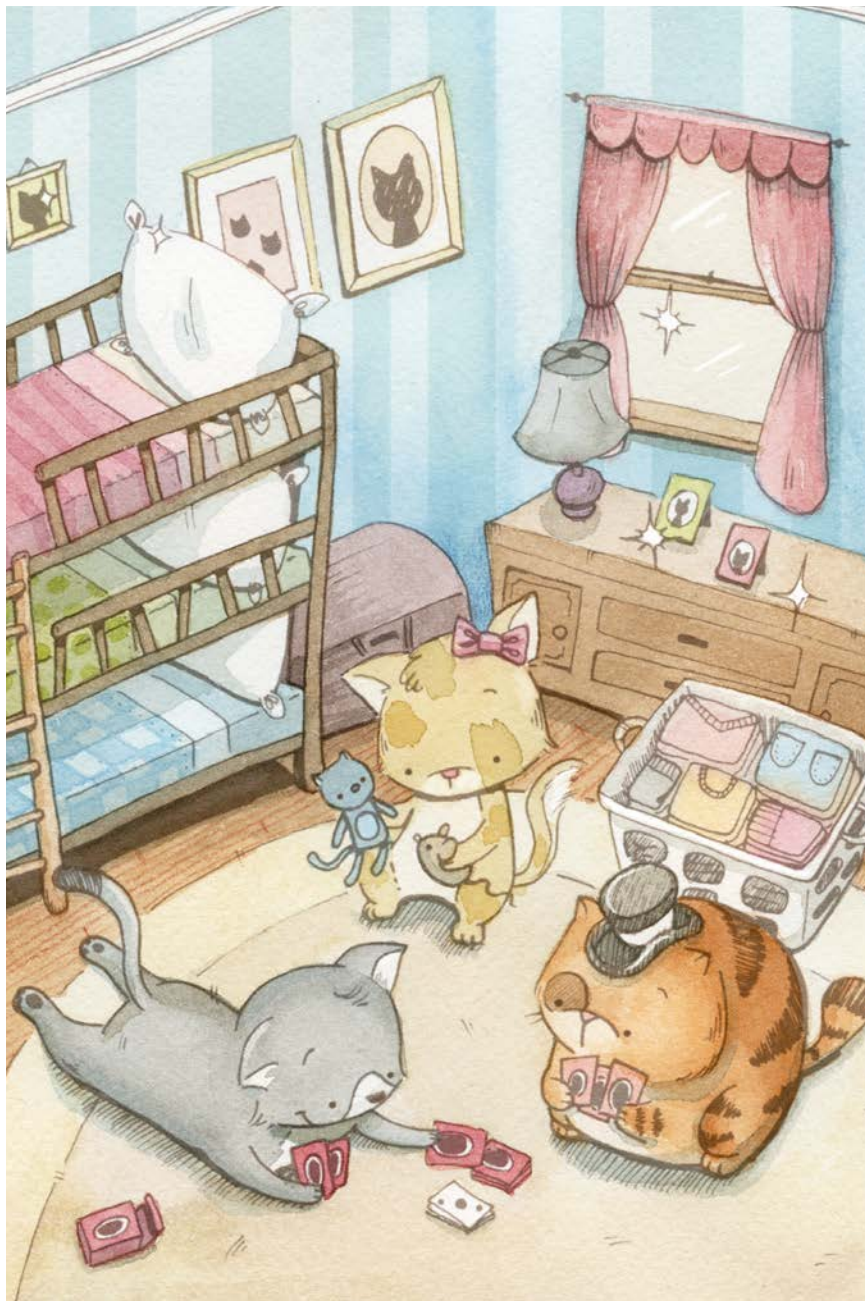
This room is clean.