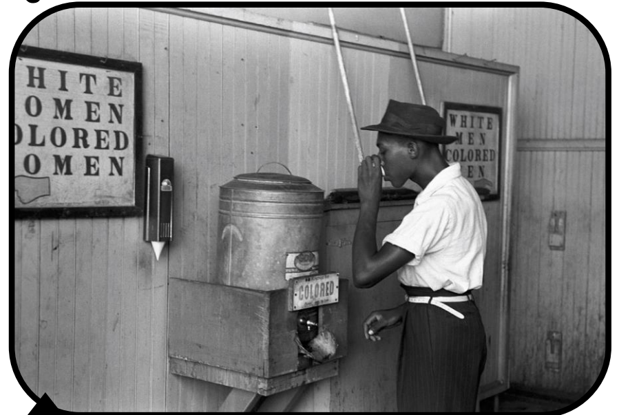
Even water fountains were segregated.

A long time ago, white people and African Americans were kept apart. They had different buses, schools, and even baseball games!